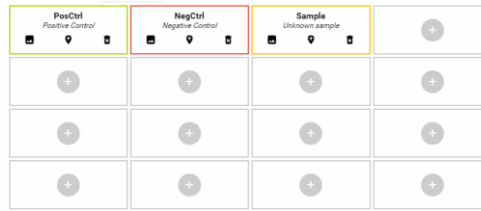
Fig 1. Cartridge set-up

The Kits have been internally tested by our quality control. Any responsibility is waived if the warranty of quality control does not refer to the specific Kits. The user is personally responsible for data that he/she will obtain and/or he/she will supply to third parties using these kits. Once the sealed package is opened the user accepts all the conditions without fail; if the package is still sealed the kit can be returned and the user can be refunded. The Kits are intended for Research Use Only.